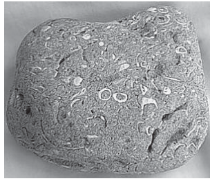
Snails and clams in concretion

■ Dentalium schencki —sometimes known as a “tusk shell”—look for “white drinking straws” in brown or gray rocks.